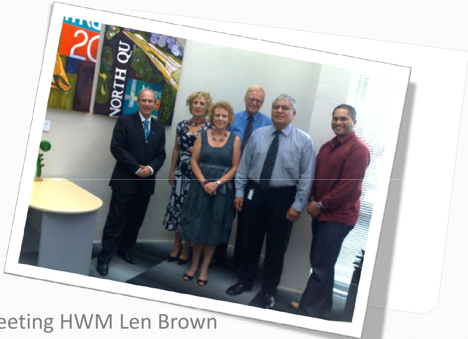
Meeting HWM Len Brown