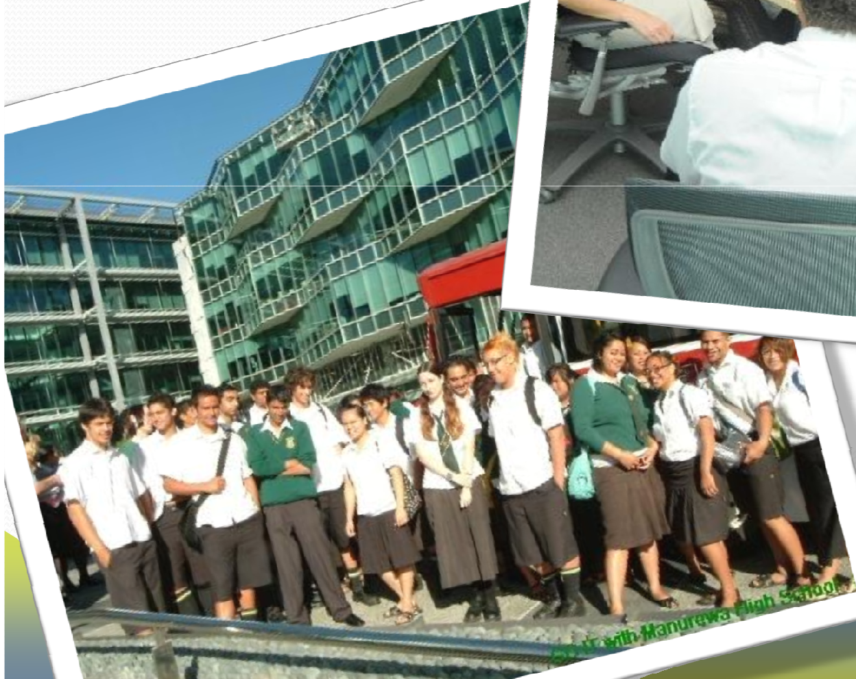
Visit with Manurewa High School